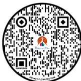
Resurrection Website Homepage

Please use these QR Codes to easily access our website and giving page.