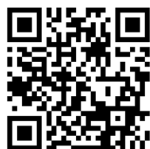
myvanco.com for Stewardship and Giving