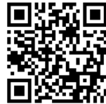
myvanco.com for Stewardship and Giving