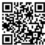
myvanco.com for Stewardship and Giving