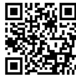
myvanco.com for Stewardship and Giving