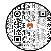
Resurrection Website Homepage

Please use these QR Codes to easily access our website and giving page.