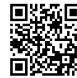
myvanco.com for Stewardship and Giving